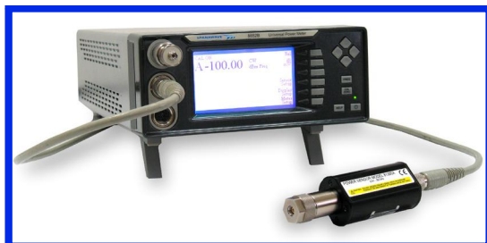
RF Power Meters