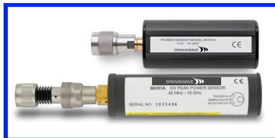
RF Power Sensors