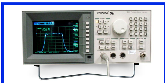
Scalar Network Analyzers