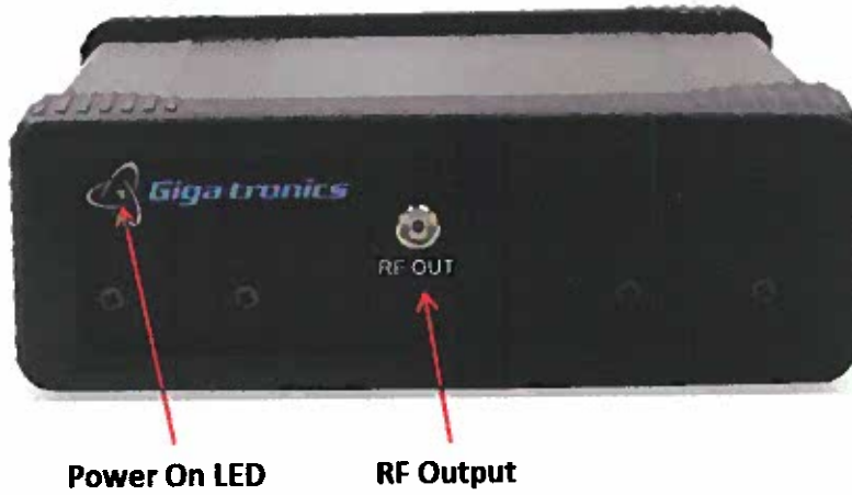
Figure 1: GT-1051B Front Panel

The following pages describe all of the features shown in Figure 1 and Figure 2.